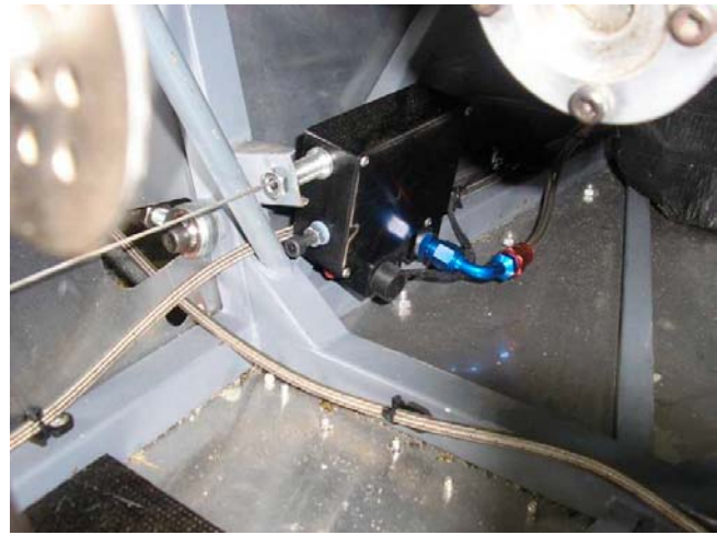
GPS adapted in place of neutral indicator switch.