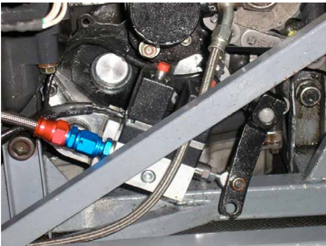
LP regulator to reduce 350psi feed from paintball cylinder Lower line goes to blipper. Right line to actuator.